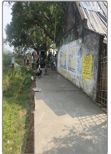
Date : 28-04-2025 Location : Address Status : Approved