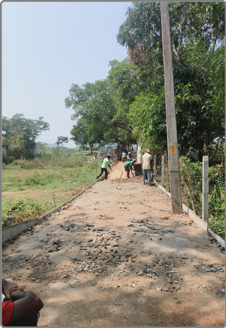
Date : 28-04-2025 Location : Address Status : Approved