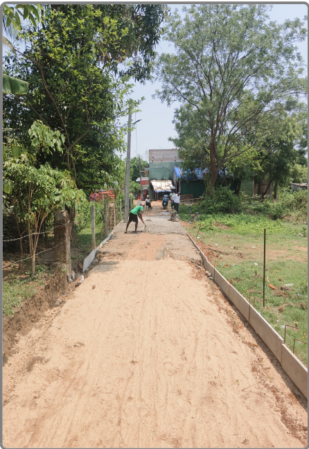
Date : 28-04-2025 Location : Address Status : Approved