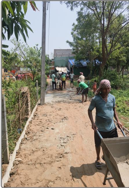
Date : 28-04-2025 Location : Address Status : Approved