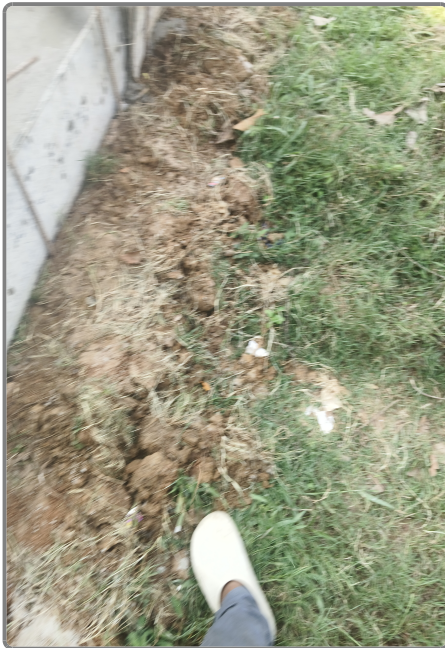
Date : 28-04-2025 Location : Address Status : Approved