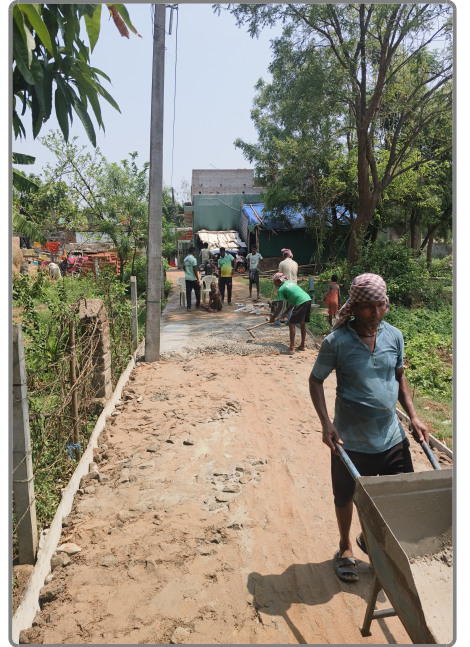
Date : 28-04-2025 Location : Address Status : Approved